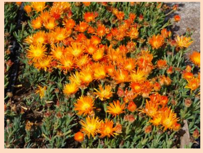
Lampranthus aurantiacus - Bush Iceplant